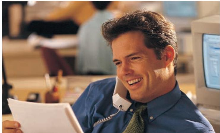
"LANSA's middleware is much faster than other AS/400 options" - Orion Systems, USA.

You retain control of your business on your chosen server. You need less code on the client. All programs inherit from the LANSAs Object Repository and simply access the server via LANSAs Open's fast and scalable middleware.